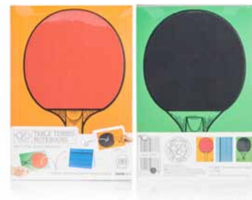
Table Tennis Notebook

Set of 3 notebooks, two bats and a net, for ideas, sketches and ping-pong 120 pages per book